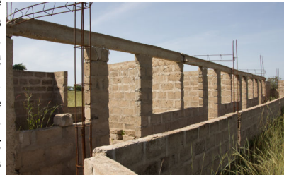
Our new home is taking shape

the site's periphery. We know that when our new home is completed, everyone will feel a surge of pride, realizing that all their hard work has finally paid off. For more details on how to contribute to this project, please visit our website.