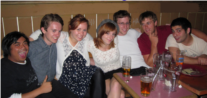
The Berlin Pipes (aka The Perlin Bipes) - Faithful regulars at HCC Trivia Night

Since March 2011, we have been hosting a weekly Trivia Night at Pour Boy Pub, a lively bar located at Christie and Bloor in downtown Toronto (666 Manning Avenue). Teams gather every Monday evening to compete for great prizes and bragging rights as the ultimate trivia champions.