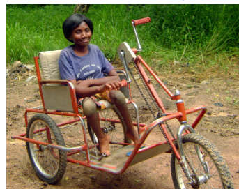
A happy recipient of a wheelchair bicycle