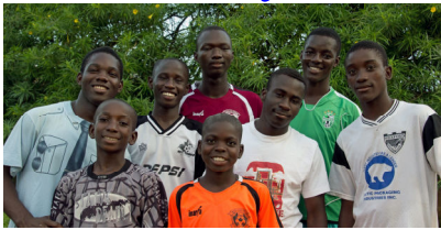
The 2011/12 Children's Council

V isitors to HCC never fail to comment on the remarkable confidence of the children at our Centre. Articulate and outspoken, our kids are full of creative ideas. In order to create a more formal forum for their voices to be heard, we established the HCC