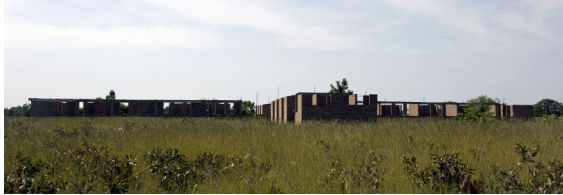
Only two more course of bricks until roofing level

The construction of our new centre is an ongoing project. Brick by brick, level by level, we are slowly working our way towards a new home for the HCC family.